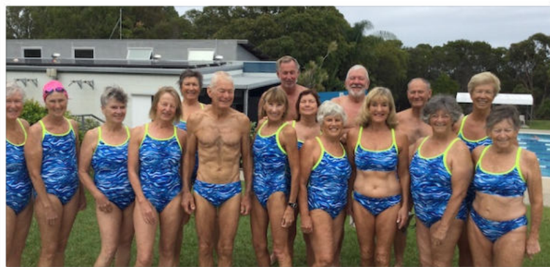
Some Noosa team members were happy to show off the new cozzies!