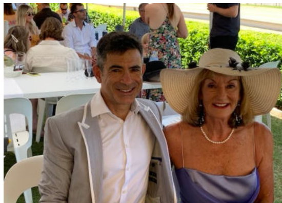
Potential winners ... regulations dashed the hopes of Noosa's "Fashions on the Field!" competitors.