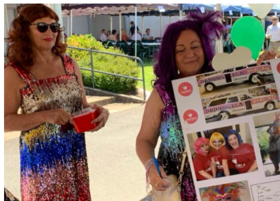
Our 'team' helped along the charity fund-raising efforts of an Australian touring Priscilla stage show. 'Fame' reported very favourably on the show at QPAC recently. "...The classic Australian film is perfectly represented as it transforms into a stage show especially for the 10 th Anniversary Australian Tour. It blew the audience out of the bar ..."